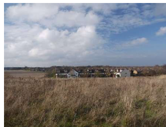
View from mound