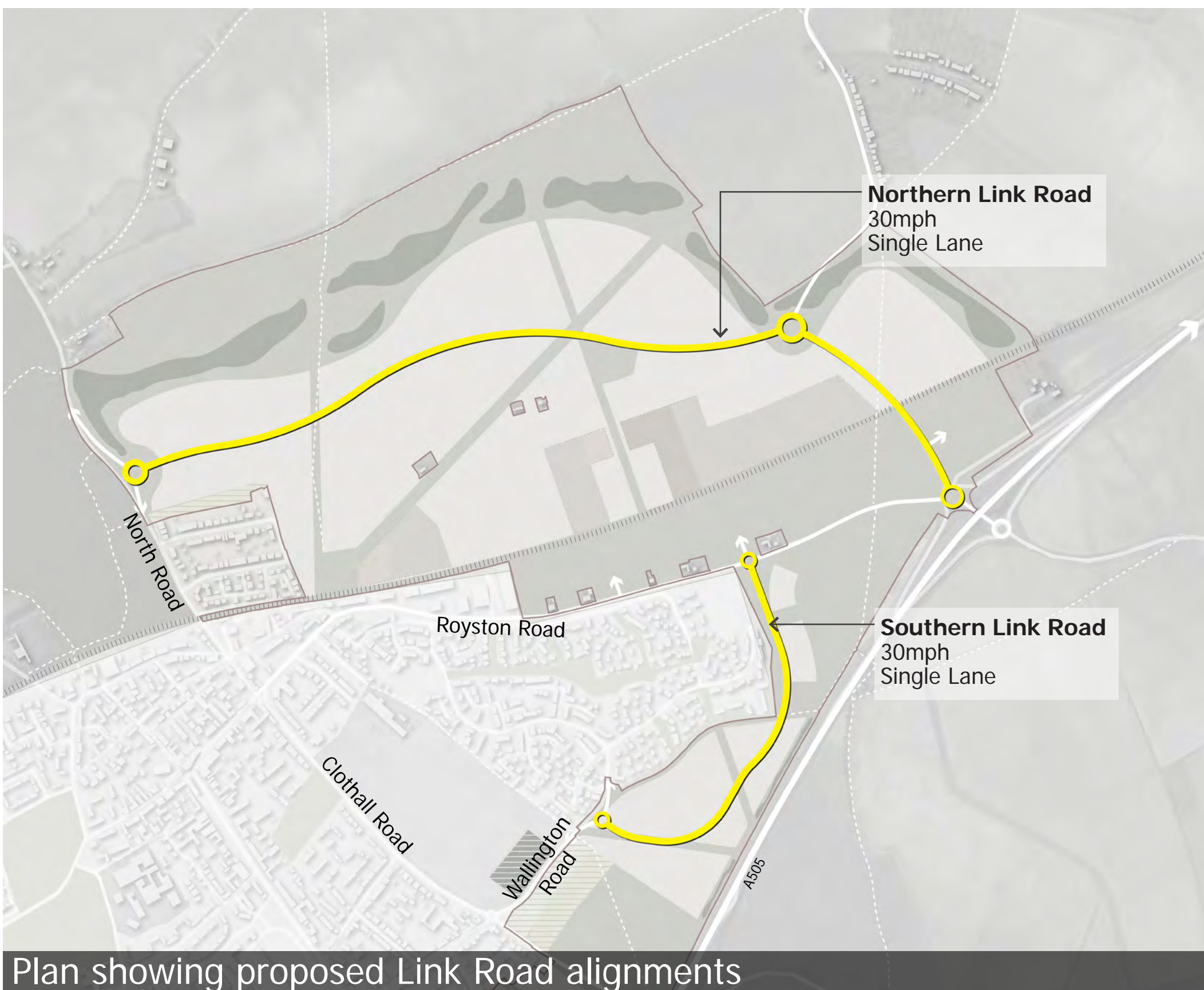
Plan showing proposed Link Road alignments

The roads will be built before the majority of development comes forward.