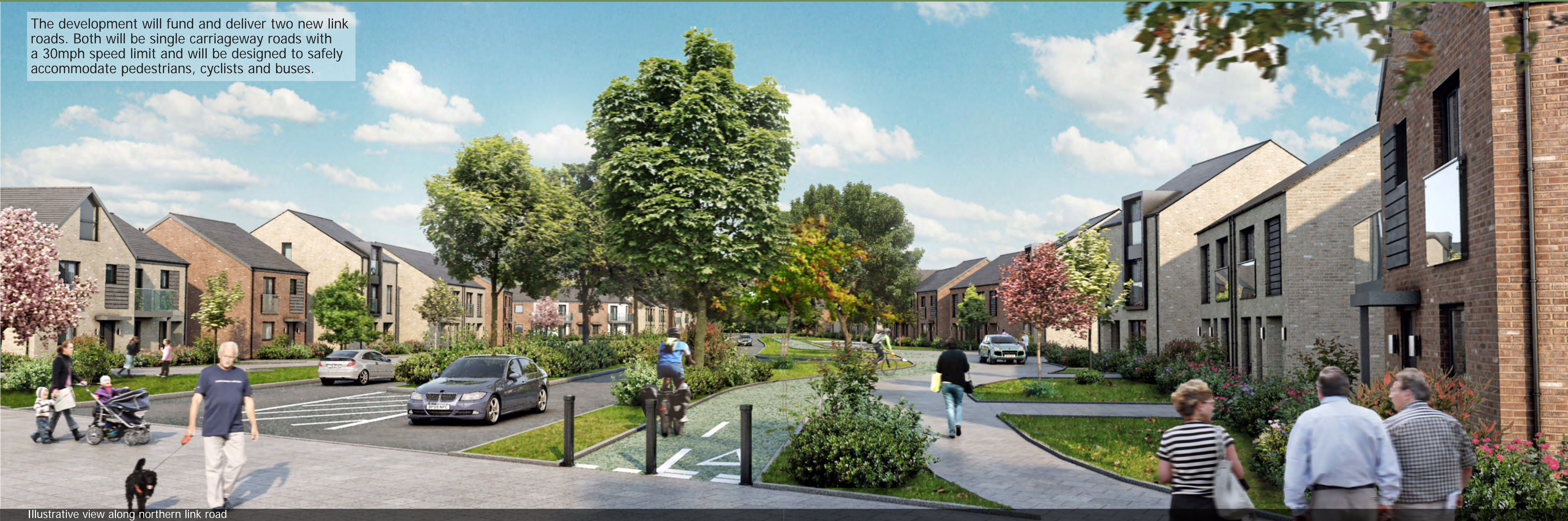
Illustrative view along northern link road

The development will fund and deliver two new link roads. Both will be single carriageway roads with a 30mph speed limit and will be designed to safely accommodate pedestrians, cyclists and buses.