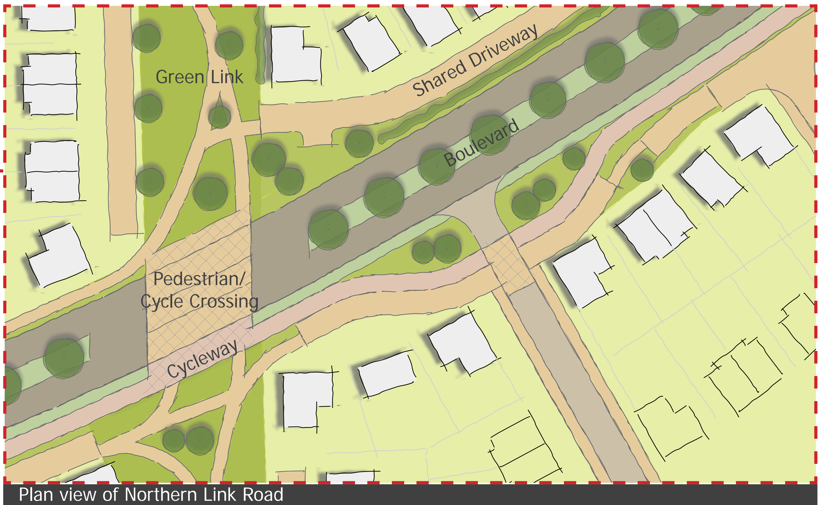
Plan view of Northern Link Road